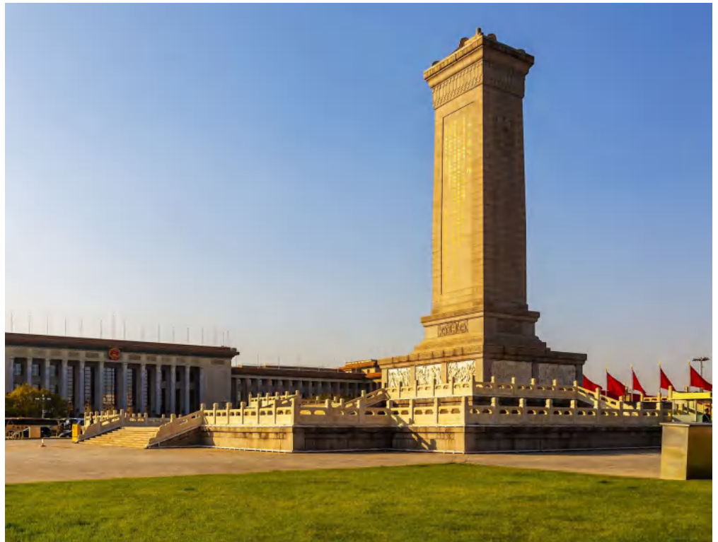
Video: What's 20th CPC National Congress? – Chinadaily.com.cn ( https://www.chinadaily.com.cn/a/202210/10/WS634366ada310fd2b29e7b7e3.html )

Speaking at a workshop attended by senior Party and government officials in July, Xi Jinping, general secretary of the CPC Central Committee, said the 20th CPC National Congress would emphasize the strategic tasks the Party will have and the major steps it will take over the next five years, which hold the key to the country's modernization drive. An effort must be made to work out new plans and measures to tackle the problem of unbalanced and inadequate development nationwide, Xi said.