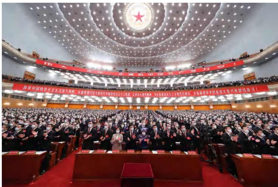
Video: Xi delivers report to 20th CPC National Congress ( https://www.chinadaily.com.cn/a/202210/17/WS634ca339a310fd2b29e7cd95.html )

China continues to steadfastly pursue an independent foreign policy of peace, mutual respect and win - win cooperation, as without peace and